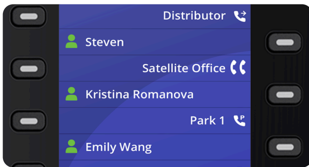
Customizable Presence Indicators

Empower employees to personalize their desk phone experience by tailoring digital presence keys to fit their unique workflow. For high-volume roles, scale visibility using sidecars to manage up to 180 programmable options.